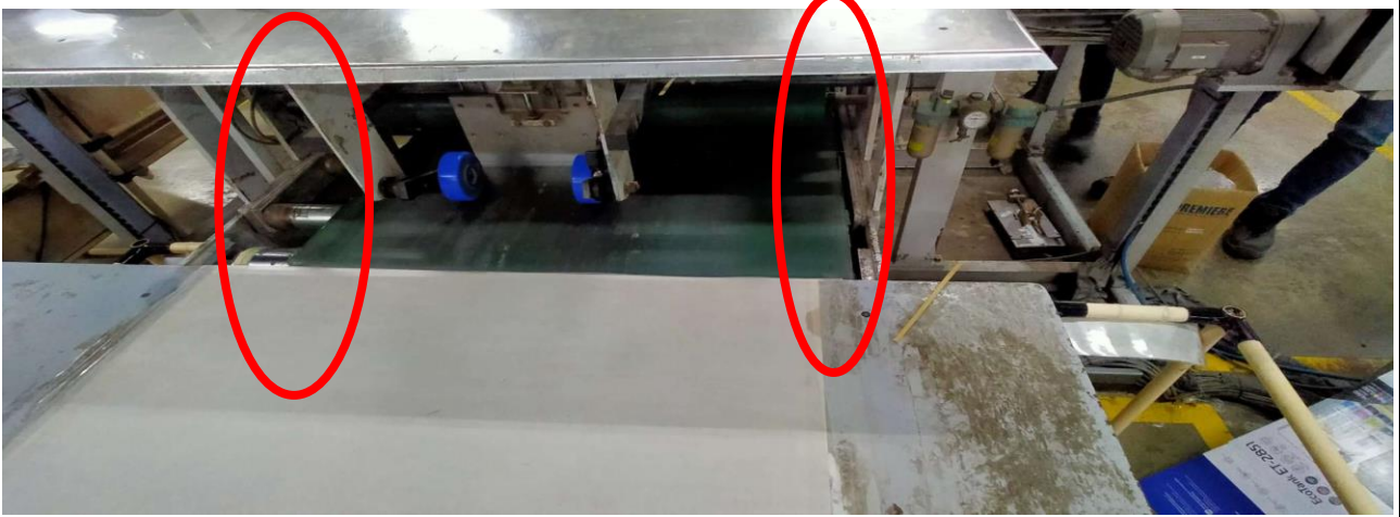
THE BELT MOVE SIDEWAYS